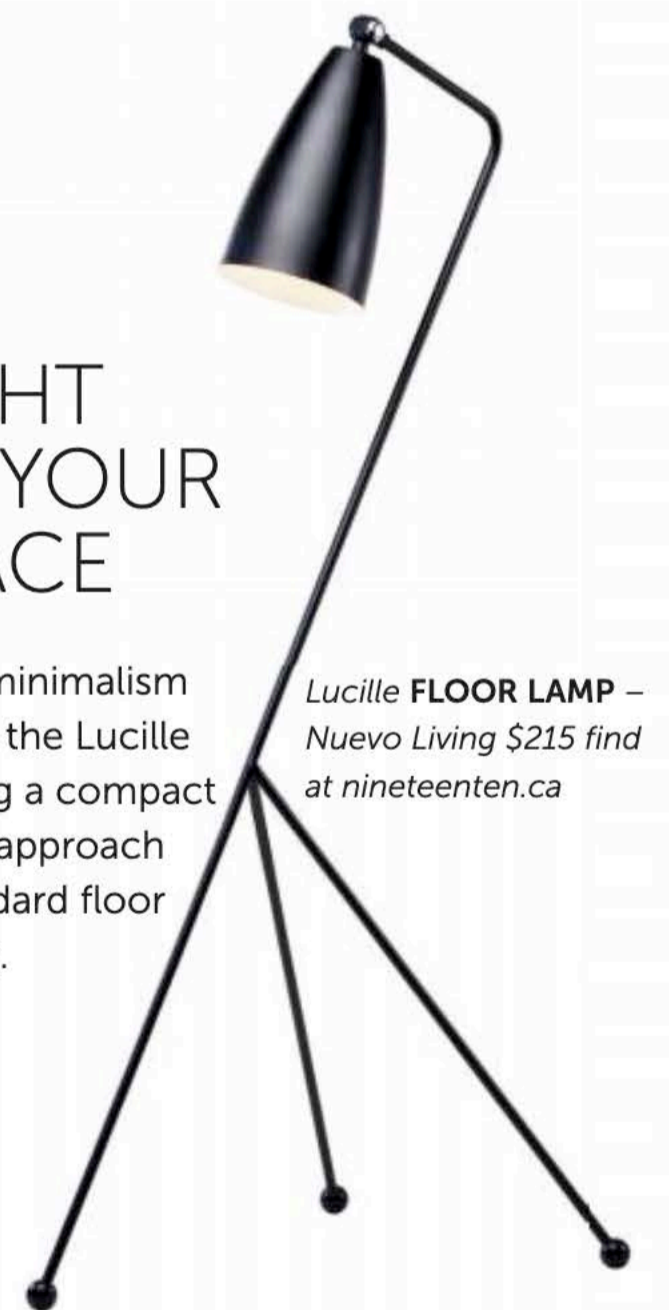
Lucille FLOOR LAMP – Nuevo Living $215 find at nineteenten.ca

Smart minimalism defines the Lucille bringing a compact design approach to standard floor lighting.